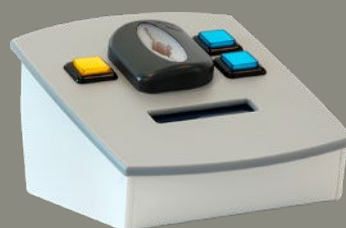
Countertop recharge box